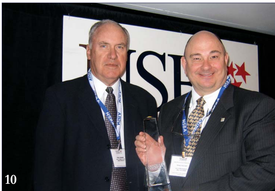
NSBA FILE PHOTO