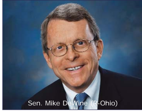
Sen. Mike DeWine (R-Ohio)

But the momentum appears to be shifting. The 2004 presidential election yielded an extremely close call (which drew scrutiny by Democrats), but ultimately went to President George W. Bush. A similar result